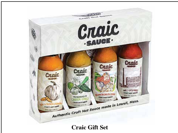
Craic Gift Set

They are planning their first B-Y-O-H-S (Bring your own hot sauce) event and are hoping to welcome visitors in the coming months. Craic Sauce is available for purchase on their official website, craicsauce.com .